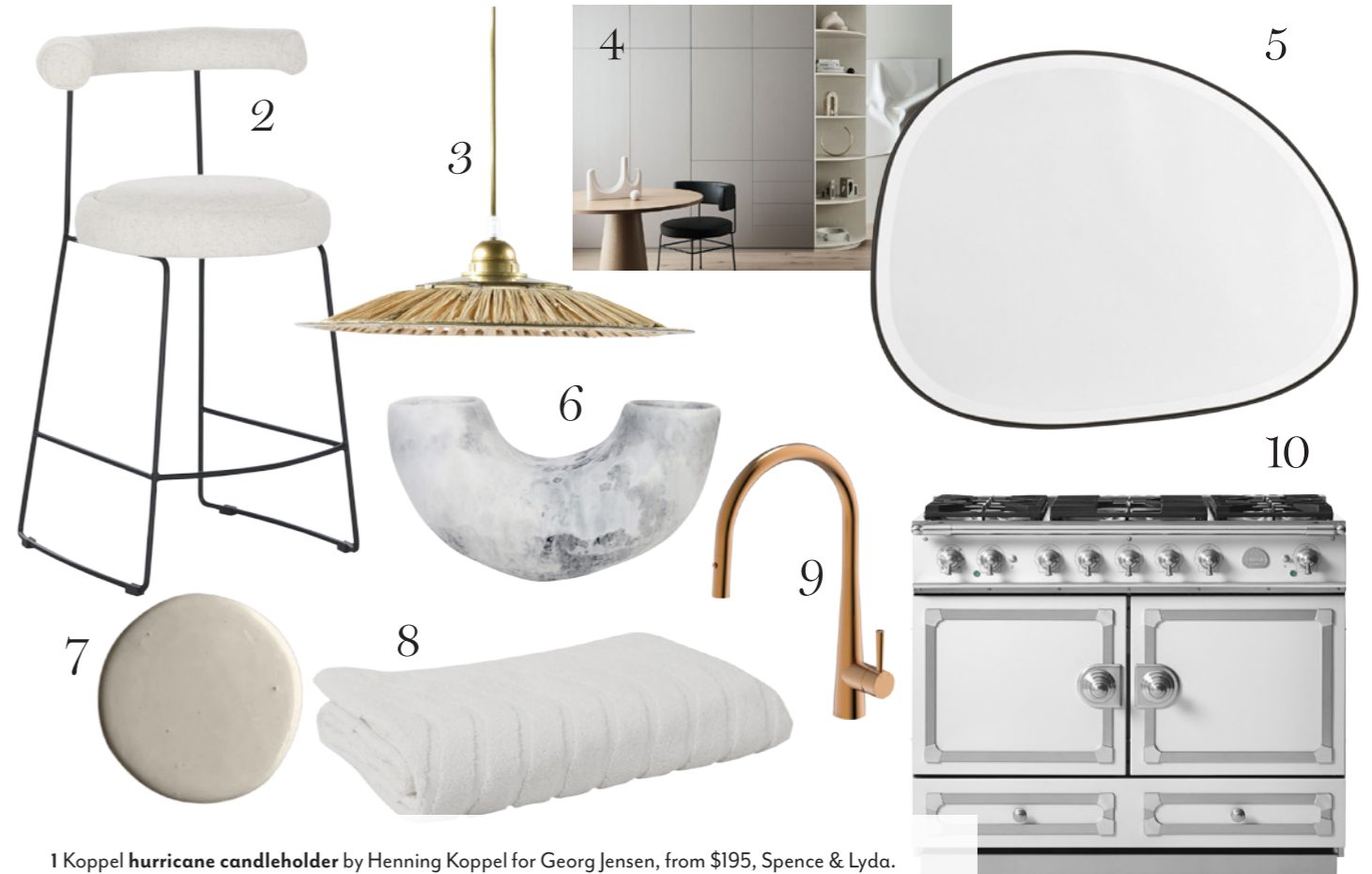
Produced by Saffron Sylvester. Room design by Bree Leech (4).

A restrained palette and elegant curved forms combine to deliver an air of relaxed sophistication.